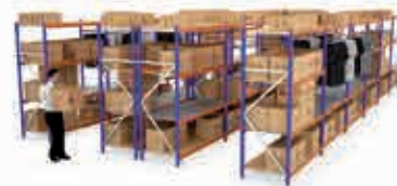
AR LS (LONGSPAN)