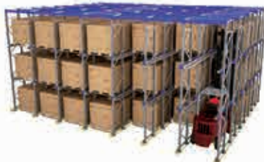
AR DRIVE IN