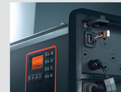
Easy service access