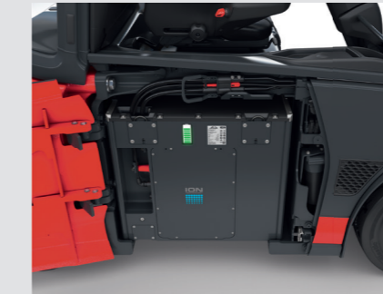
Highest protection in case of accident