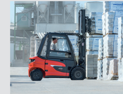
X35 equipped with Li-ION battery