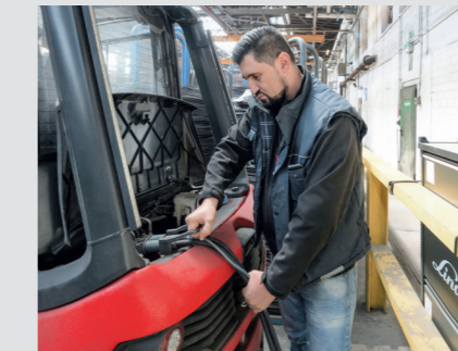
Quick access to charge